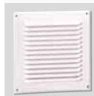
GRA-70 Aluminium grille.