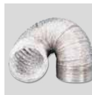
GSA-100 Flexible aluminium ducting.