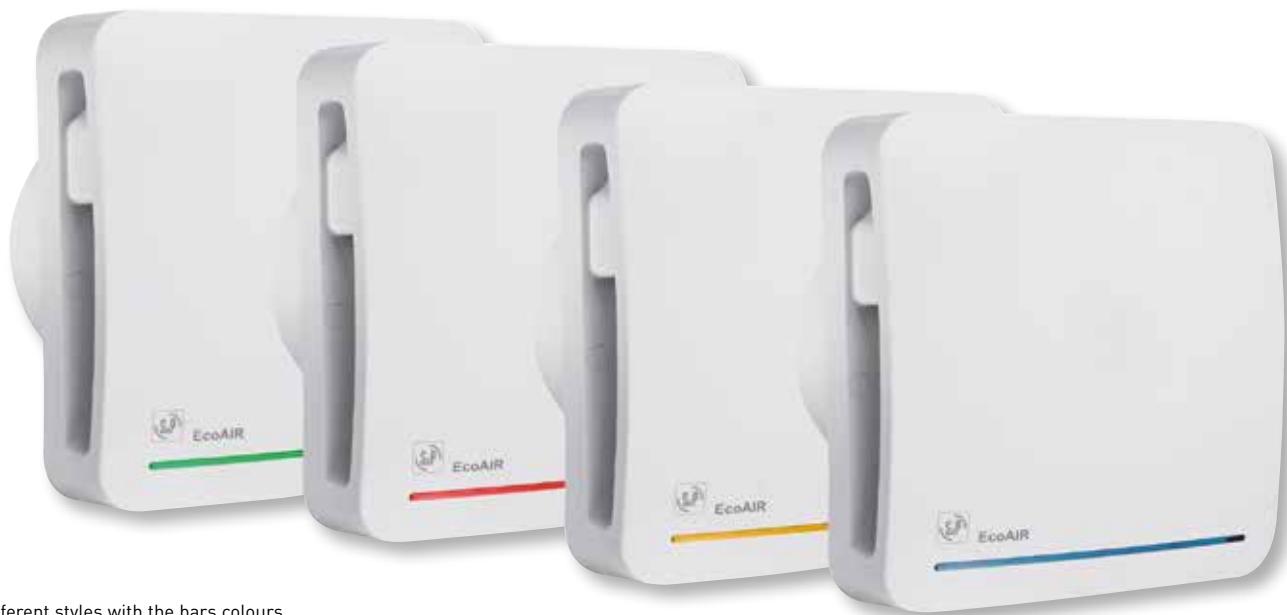
Different styles with the bars colours.