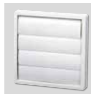
PER-100W Back draft shutter.