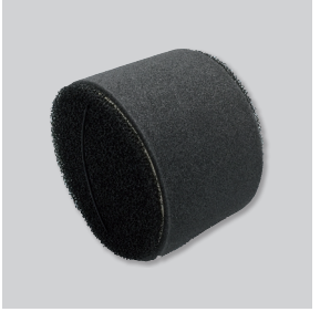
Ceramic heat exchanger with performance up to 93%, protected with a G3 filter at both ends