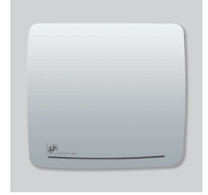
Internal front cover of elegant design, which allows adaptation to any environment

Heat recovery RESPIRO www.solerpalau.com