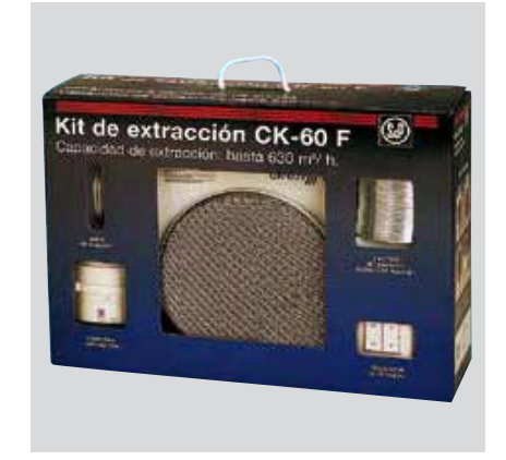
Kit CK-60 F Includes: 1 CK-60F fan 3 m of GSA-125 flexible duct 2 duct connectors CX-125/215 1 backdraft shutter CM-130 1 two speed switch REGUL-2

Kitchen extract fans CK www.solerpalau.com