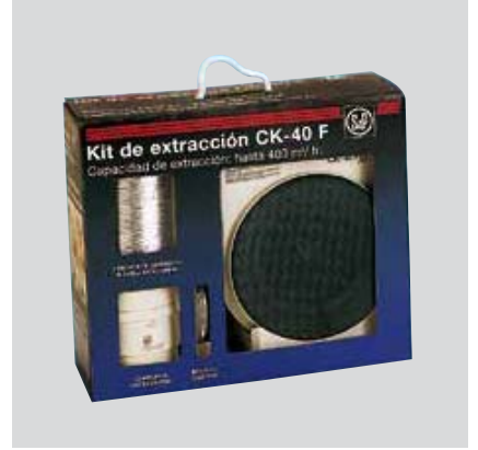
Kit CK-40 F Includes: 1 CK-40F fan 3 m of GSA-100 flexible aluminium ducting 2 duct connectors CX-80/125 1 backdraft shutter CM-130

Are fitted with all the elements (extractor and accessories) needed to carry out a successful installation.